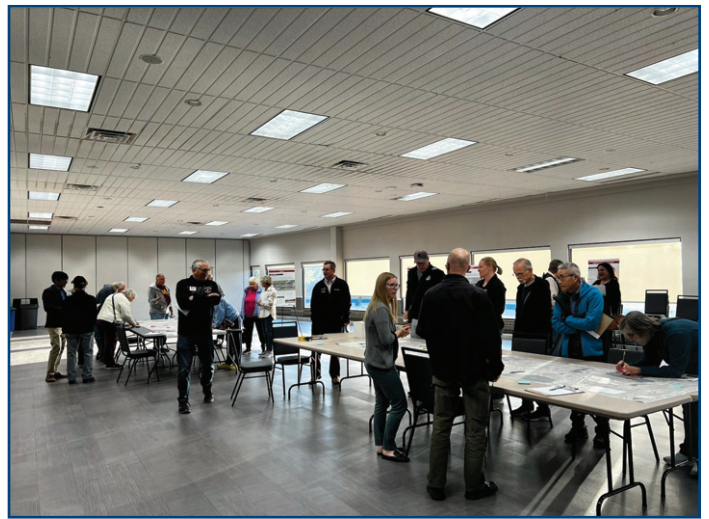
Community members providing feedback at an open house event (above)