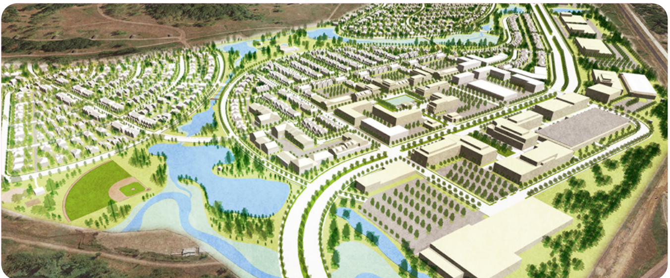
Rice Creek Commons