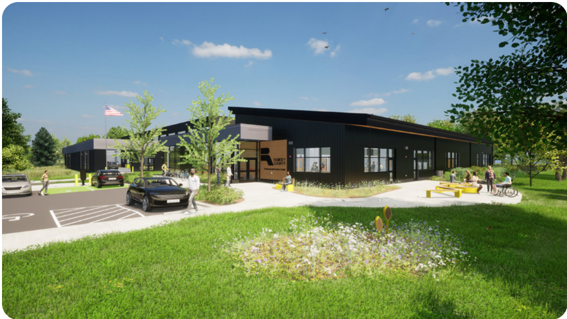
Rendering of the Ramsey County Environmental Service Center